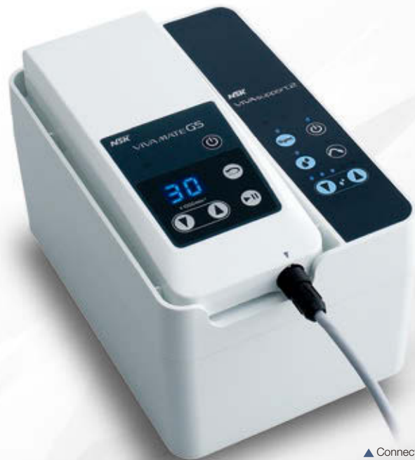
▲ Connection to VIVAMATE G5 (VIVAMATE G5 is an option)

VIVAsupport 2 is a system for irrigation and saliva ejection developed based on a new concept: the pursuit of "portability" and "flexibility", required for mobile dentistry. A light and compact control unit equipped with functions required for mobile dentistry can be stored in a light, durable, and dedicated carrying case. Using VIVAsupport 2 combined with Varios 370, compact ultrasonic scaler, dentists can provide not only mobile dentistry, but also maintenance care. VIVAsupport 2 is the next-generation mobile dentistry system, providing services from the adjustment of dentures to comprehensive treatment.